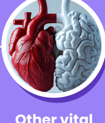
Other vital organs

Because it can impact different parts of the body, lupus often looks different for everyone.